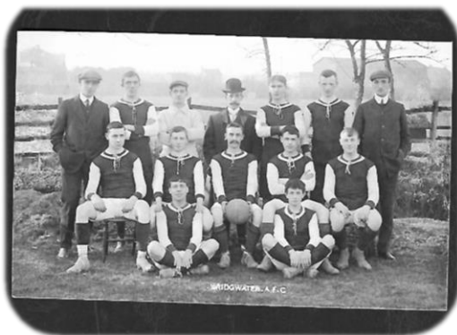
Unsure which of the two Bridgwater AFC's this is?

Two years later, another Bridgwater AFC was formed and played for ten years in local leagues from their base in the Westonzoyland Road area of the town. 1914 saw this club fold due to the outbreak of World War One.